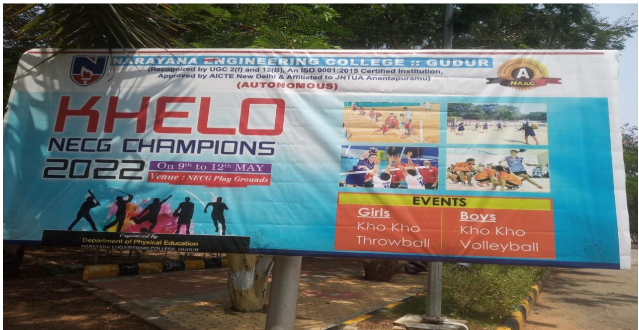
Event Outdoor flex