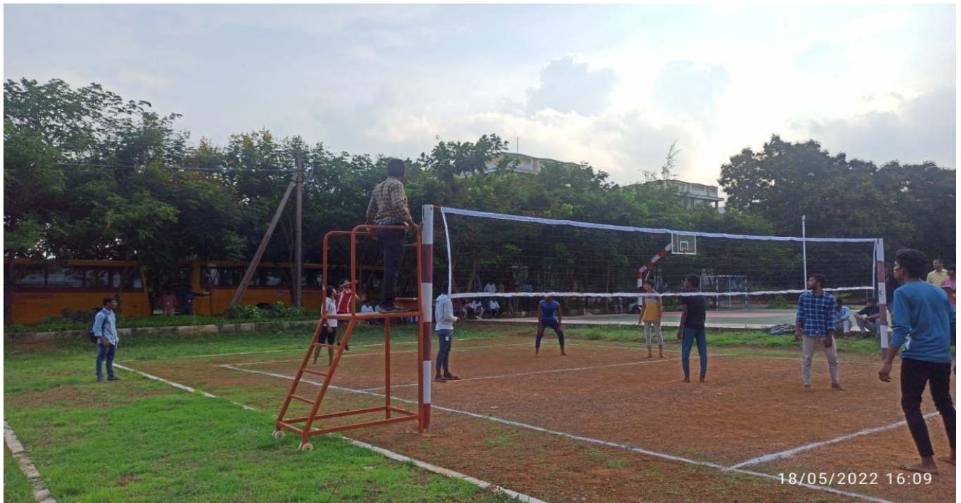
Students Playing Volley Ball Game